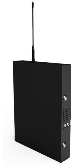
SMA 1000 Repeater

Sapling offers two repeater models for the wireless clock system – the Wireless Network Repeater (SMA-1SM) and the Wireless Repeater (SMA-1SR). This brochure explains the differences between the two types of repeaters, and when repeaters might be needed with the Sapling Wireless Clock System.