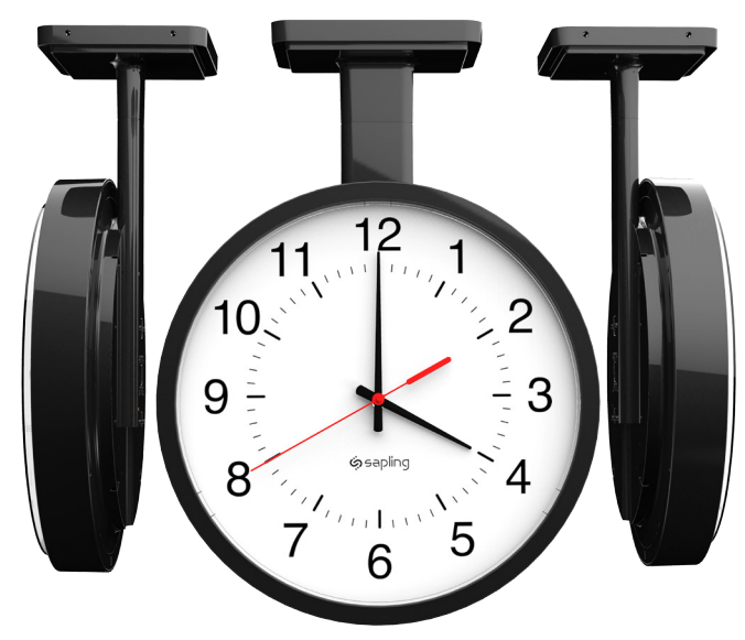
Four-way facing ceiling mount analog clocks