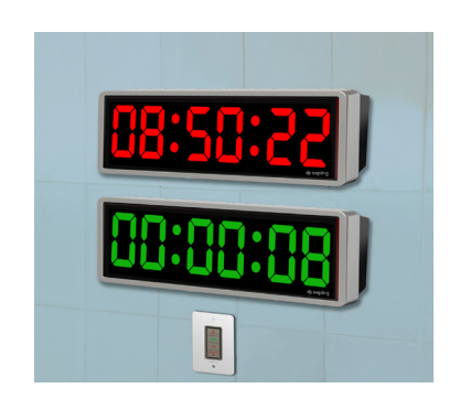
Surface (Wall) Mount

The above solutions can be offered as part of a Sapling Synchronized Clock System which may be Wired, Wireless or IP based. Depending on the synchronization method, the digital clocks/elapsed timers may be offered with either surface (on the wall) mounted option or a flush mounted (in the wall installation) option.