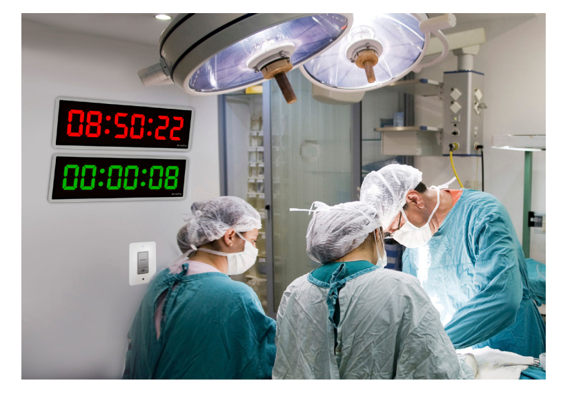
Please view the Elapsed Timer video clips here.

Healthcare facilities are faced with the pressures to perform decisively during emergencies every single day. With the use of Sapling's Elapsed Timer, doctors and nurses can focus on treatment knowing the Elapsed Timer is showing them precise time. The next time you hear "Attention: Code Blue!" announced in your facility, you are sure to benefit from what a Sapling Elapsed Timer solution has to offer.