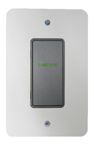
*Optional Button Kit Part Number: SBD-ELT-BUT-0

Healthcare facilities are faced with the pressures to perform decisively during emergencies every single day. With the use of Sapling's Elapsed Timer, doctors and nurses can focus on treatment knowing the Elapsed Timer is showing them precise time. The next time you hear "Attention: Code Blue!" announced in your facility, you are sure to benefit from what a Sapling Elapsed Timer solution has to offer.