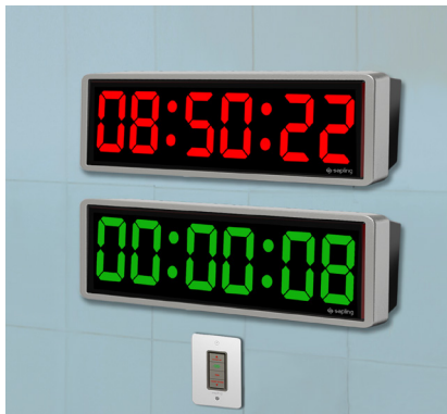
Surface (Wall) Mount

This solution can be offered as part of a Sapling Synchronized Clock System which may be Wired, Wireless or IP based. Depending on the synchronization method, the digital clocks/elapsed timers may be offered with either a surface mounted option (on the wall) or a flush mounted option (in the wall).